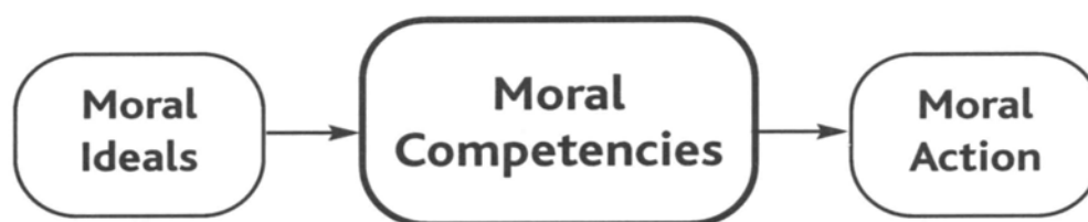
FIGURE 8.1. The Dual Aspect Model